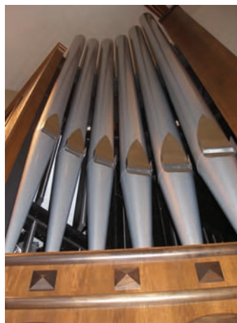
Closeup of casework details and façade pipes arranged in an arc

The 16' Trombone and 16' Basson-Hautbois provide the reed foundation for this instrument. The 16' Trombone in the Pedal division is available as a manual extension to provide a dynamic solo reed. This stop is eight inches in scale at CCC and is on a moderately high wind pressure. It provides a rich, vibrant voice in the favorable acoustics of the room and can work equally well as a solo voice or logi-