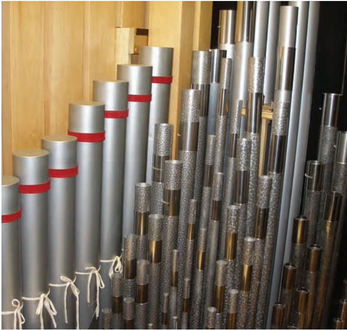
Pipes inside the Swell chamber