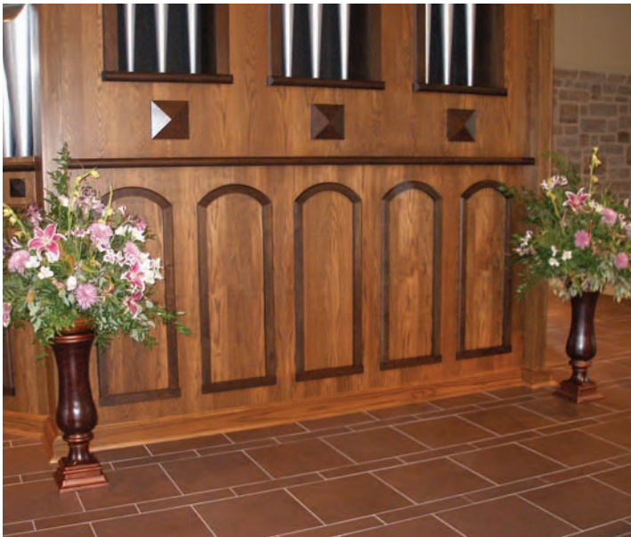
Closeup of organ casework details