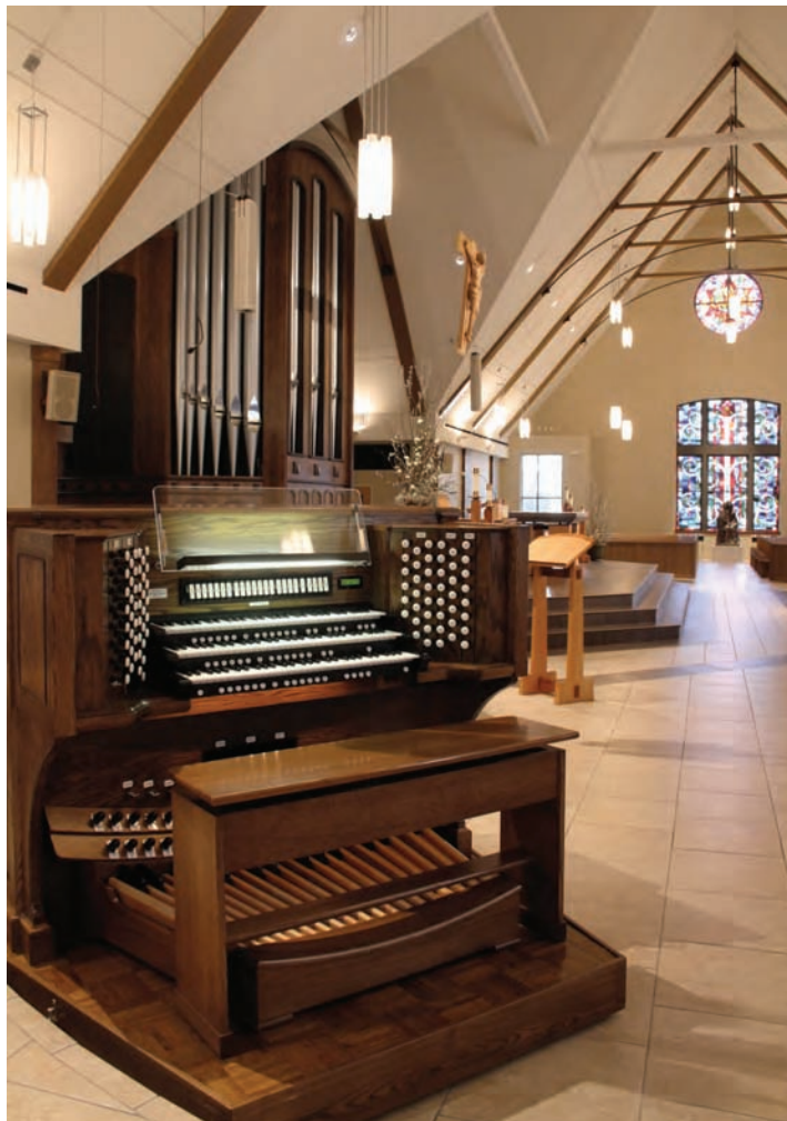
Console on movable platform

When I was brought into the project, the basic layout of the sanctuary had already been formed and we lacked a space that allowed