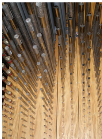
Pipes inside the Swell chamber

cal conclusion to the ensemble in large registrations.